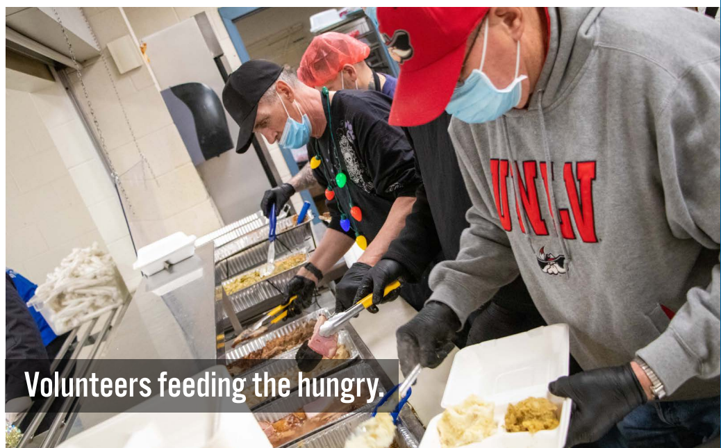
Volunteers feeding the hungry.

THANK YOU for joining us in our ongoing mission to provide help, hope and healing to “the last, the lost, and the least”! †