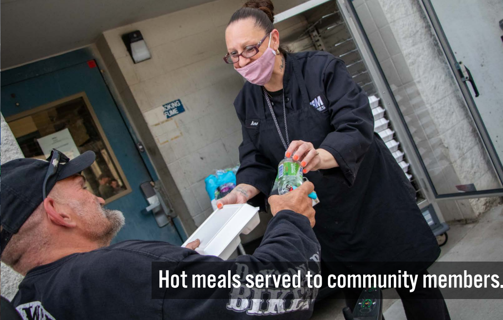
Hot meals served to community members.

and boxed dinners for anyone in need in our community. We came to call our kitchen staff and chefs “The Dream Team”, watching in awe as they rose to the challenge of meeting the needs of the hungry despite the challenges of the ongoing pandemic.